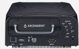
Mobile NVR with GPS