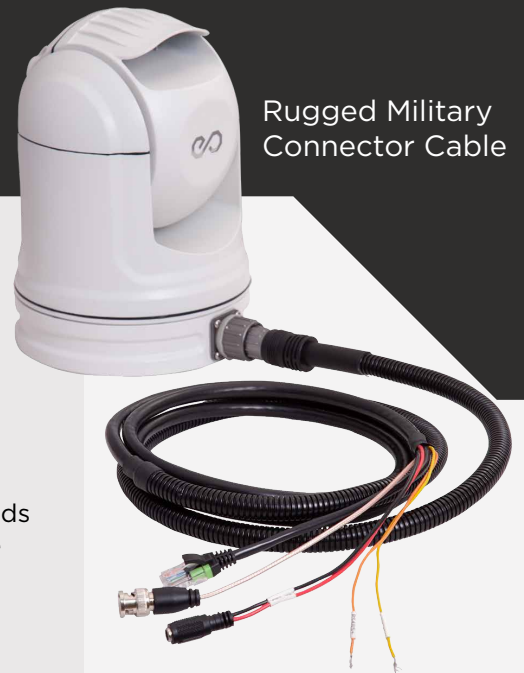
Rugged Military Connector Cable