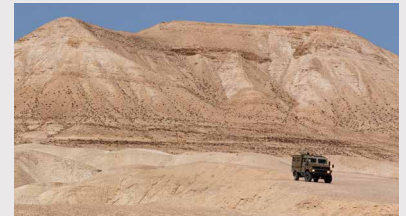
Approximate FOV at 1km

The optical camera has been designed and optimized for long-range surveillance. It uses a 1/2.8" progressive scan CMOS sensor with an HD resolution of 1920x1080 and a signal to noise ratio over 55dB. The 1/2.8" sensor has excellent spectral sensitivity for both visible and NIR wavelengths and features an automatic IR cut filter, making it a true day/night camera providing clear color images by day and black and white images at night. The 1/2.8" sensor provides an excellent balance between light sensitivity and maximum zoom, making it particularly suited for long range surveillance. Also integrated is the latest technology in real-time image processing such as BLC, HLC, WDR, EIS, 3D DNR, Defog/Haze, etc. All of these settings can be changed and configured remotely, along with remote pan, tilt and zoom control.