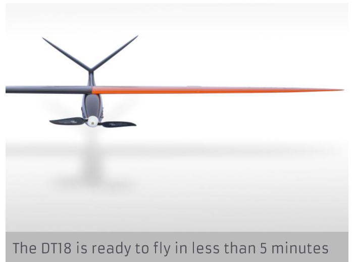
The DT18 is ready to fly in less than 5 minutes

The DT18 is easily transported in its rugged flight case or in the DT18 backpack: just pick the option that suits you best.