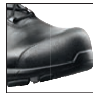
HAIX® Composite Toe Cap