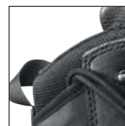
HAIX® Climate System