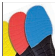
Vario Wide Fit System