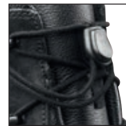
HAIX® Smart Lacing