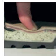
HAIX® MSL System