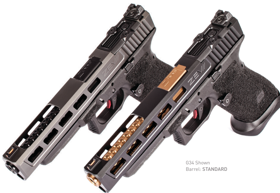
G34 Shown Barrel: STANDARD

Slide Color: TITANIUM GRAY Barrel: STANDARD Barrel Color: DLC