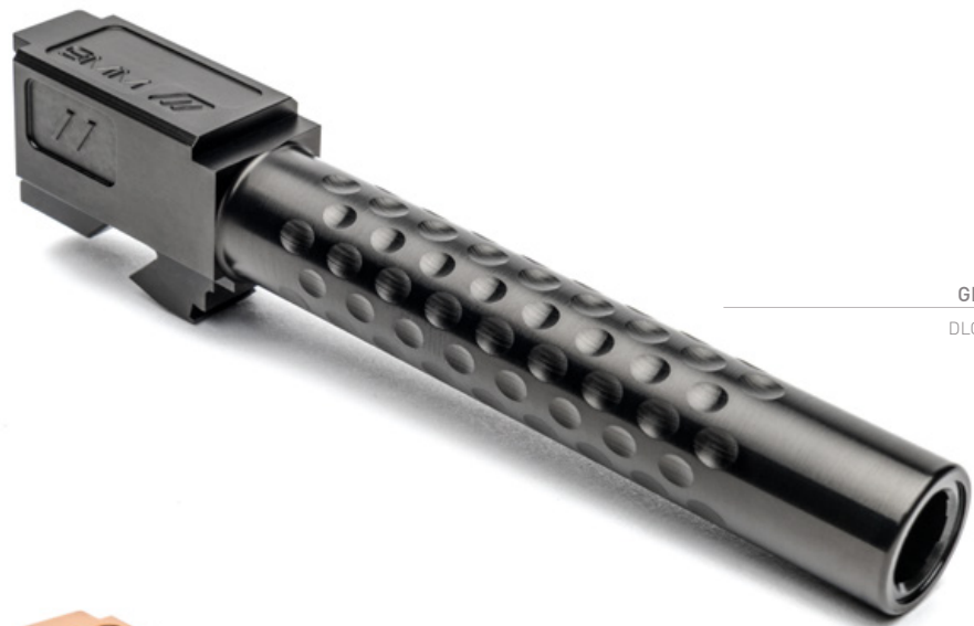
GLOCK 17 DLC SHOWN