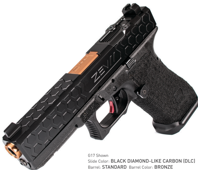
G17 Shown Slide Color: BLACK DIAMOND-LIKE CARBON (DLC) Barrel: STANDARD Barrel Color: BRONZE