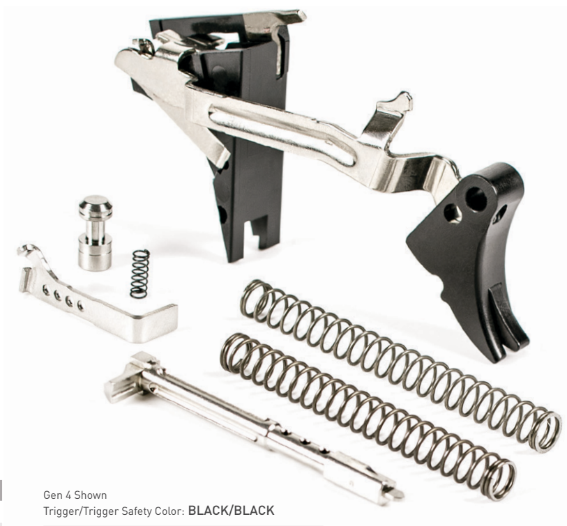
Gen 4 Shown Trigger/Trigger Safety Color: BLACK/BLACK