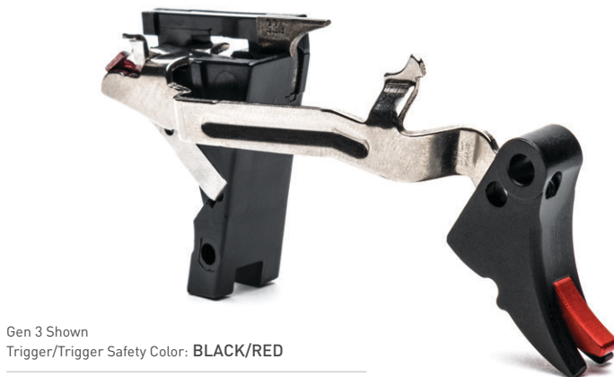
Gen 3 Shown Trigger/Trigger Safety Color: BLACK/RED