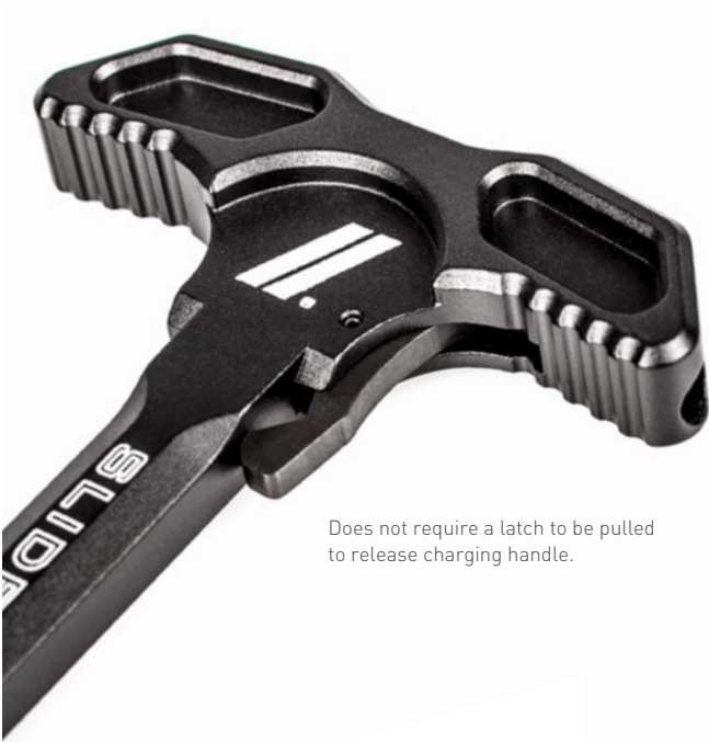
Does not require a latch to be pulled to release charging handle.