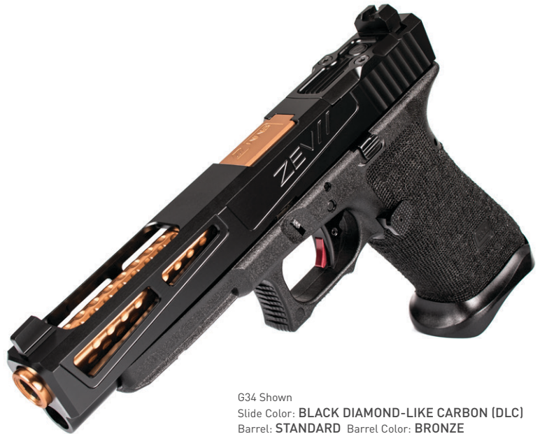
G34 Shown Slide Color: BLACK DIAMOND-LIKE CARBON (DLC) Barrel: STANDARD Barrel Color: BRONZE