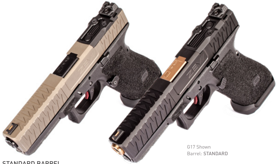
G17 Shown Barrel: STANDARD

Slide Color: FLAT DARK EARTH (FDE) Barrel: STANDARD Barrel Color: DLC