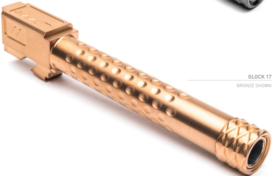
GLOCK 17 BRONZE SHOWN