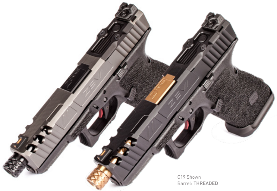
G19 Shown Barrel: THREADED

Slide Color: TITANIUM GRAY Barrel: THREADED Barrel Color: DLC