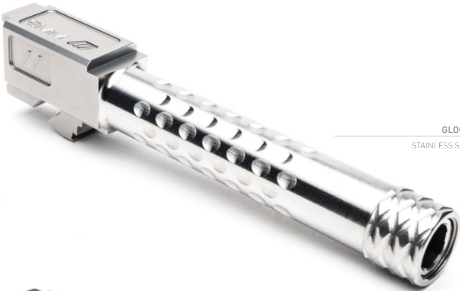
GLOCK 19 STAINLESS SHOWN