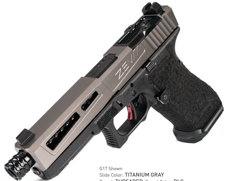
G17 Shown Slide Color: TITANIUM GRAY Barrel: THREADED Barrel Color: DLC

Slide Color: BLACK DIAMOND-LIKE CARBON (DLC) Barrel Color: BRONZE