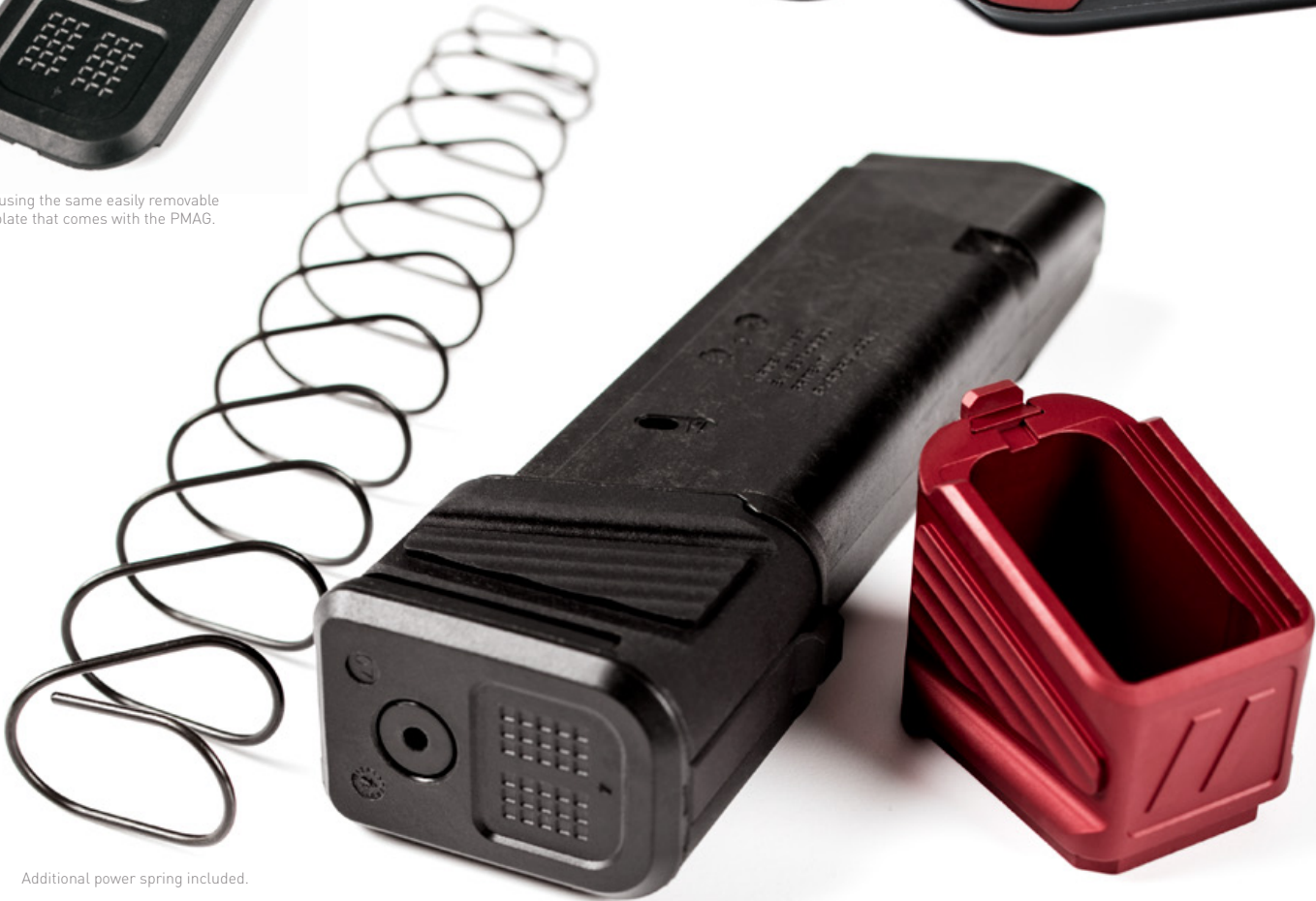
Additional power spring included.