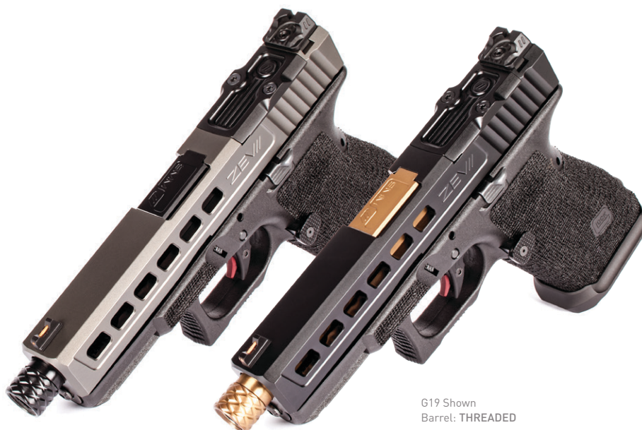
G19 Shown Barrel: THREADED

Slide Color: TITANIUM GRAY Barrel: THREADED Barrel Color: DLC