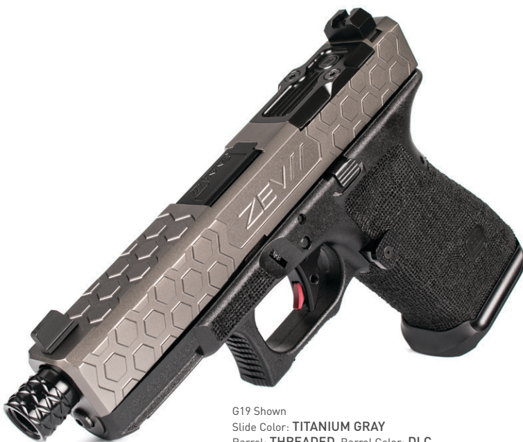
G19 Shown Slide Color: TITANIUM GRAY Barrel: THREADED Barrel Color: DLC

Slide Color: BLACK DIAMOND-LIKE CARBON (DLC) Barrel Color: BRONZE