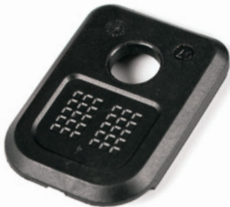
Install using the same easily removable floor-plate that comes with the PMAG.