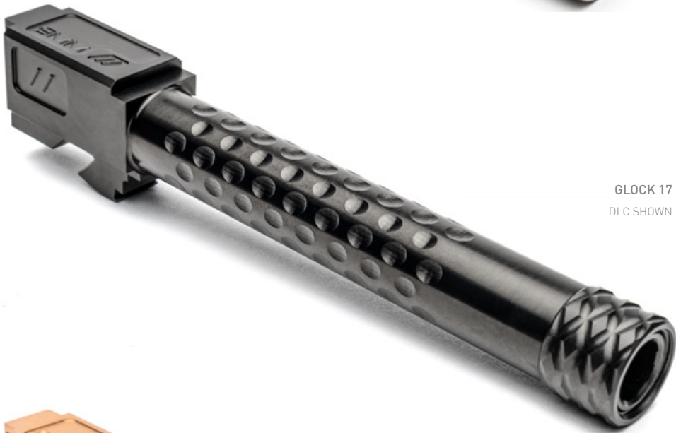
GLOCK 17 DLC SHOWN