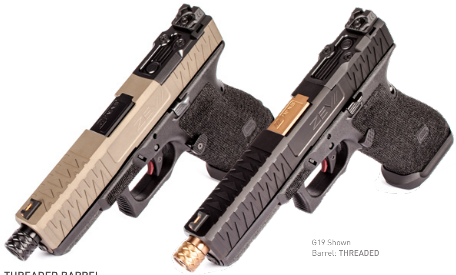
G19 Shown Barrel: THREADED

Slide Color: FLAT DARK EARTH (FDE) Barrel: THREADED Barrel Color: DLC