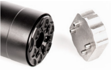
Disassembly tool included