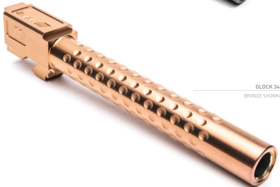
GLOCK 34 BRONZE SHOWN