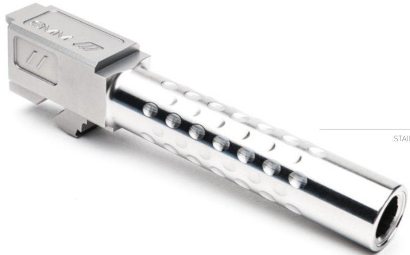
GLOCK 19 STAINLESS SHOWN