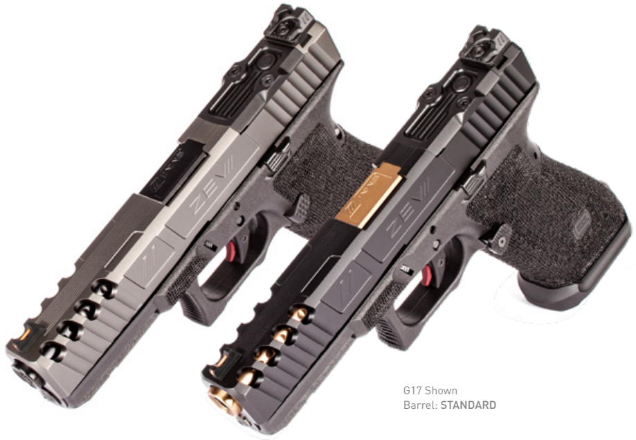
G17 Shown Barrel: STANDARD

Slide Color: TITANIUM GRAY Barrel: STANDARD Barrel Color: DLC