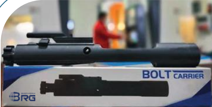
223 / 5.56 Bolt Carrier Group, Nitride QPQ MPI