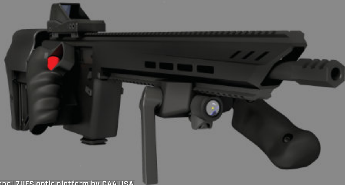
Pictured with optional ZUES optic platform by CAA USA