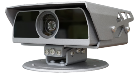
On-Board ANPR+MMR, powered by: